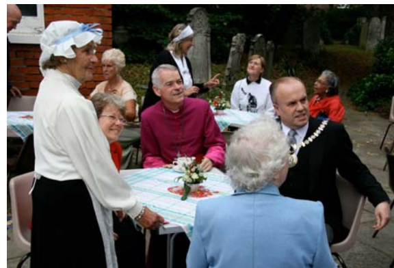
13 Tea is served and Smudge provide some entertainment off camera