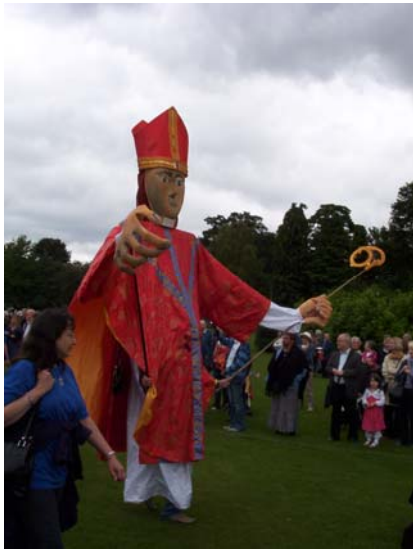
St Albans Pilgrimage celebrations